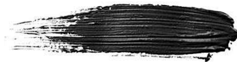
Royal Black 18ml cod. E15-35 7ml cod. E5-35

Warm Black: Permanent makeup color for eyes and eyeliner. Biotek's Warm Black pigment is an intense and warm black, ideal for graphic eyeliners and infralashes.