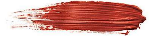
Mineral Red 18ml cod. E15-19 7ml cod. E5-19

Orange is a mixing color / modifier for permanent make-up and microblading pigments. Biotek's Orange color can be added to another color, in the capsule, to make it warmer.