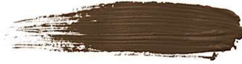
Paris 18ml cod. E15-08 Neutral Brown 7ml cod. E5-08

Neutral brown color for eyebrows. Paris has a neutral tendency which makes it ideal for working on all neutral skins with brown eyebrows. Do not use it on warm skin tones