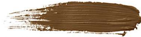
San Paolo 18ml cod. E15-06 Warm Light Brown 7ml cod. E5-06

Warm blond color for eyebrows. Berlin has a slight red tendency. Ideal for working on fair skins with a cold undertone, or for correcting eyebrows slightly turned to gray.