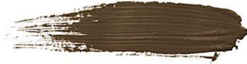
Portofino 18ml cod. E15-07 Cold Brown 7ml cod. E5-07

Cold brown color for eyebrows. Portofino has a slight cold / green tendency.. Ideal for working on skin with warm undertones or for correcting eyebrows that have turned slightly red.