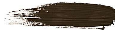
Warm Brown 18ml cod. E15-36 7ml cod. E5-36

Royal Black: Permanent makeup color for eyes and eyeliner. Biotek's Royal Black pigment is a long-lasting intense black, ideal for graphic eyeliners and infralashes.