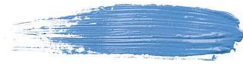
Blue Sky 18ml cod. E15-38 7ml cod. E5-38

Deep Ocean: Permanent makeup color for eyes and eyeliner. Biotek's Deep Ocean pigment is an intense blue, ideal for a graphic eyeliner or a shaded eyeliner.