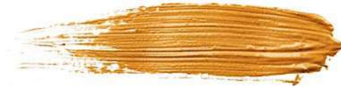
Yellow 18ml cod. E15-17 7ml cod. E5-17

Yellow: is a mixing color for permanent make-up and microblading pigments. Biotek's Yellow color must be added to another color in the capsule to make it lighter.