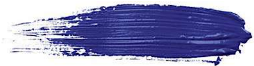
Deep Ocean 18ml cod. E15-40 7ml cod. E5-40

Warm Brown: Permanent makeup color for eyes and eyeliner. Biotek's Warm Brown pigment is a rich and intense brown, ideal for graphic eyeliners and infralashes on blonds.