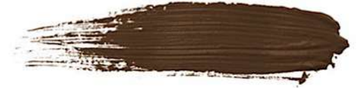
Rome 18ml cod. E15-09 Warm Brown 7ml cod. E5-09

Warm brown color for eyebrows. Rome has a slight red tendency. Ideal for working on people with a cold undertones, or for correcting slightly gray eyebrows.