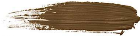
Ibiza 18ml cod. E15-05 Neutral Light Brown 7ml cod. E5-05

Neutral blond color for eyebrows. Moscow is ideal for working on fair skin and blond eyebrows. The color has a prevalence of yellow and a neutral undertone.