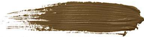
Madrid 18ml cod. E15-04 Cold Light Brown 7ml cod. E5-04

Cold blond color for eyebrows. Hollywood has a slight green tendency. Ideal for working on fair skins with red undertones or for correcting blond eyebrows, slightly turning red.