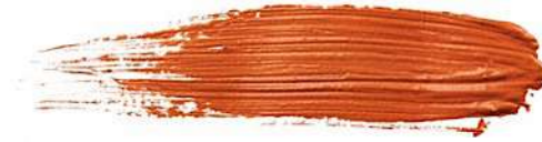
Orange 18ml cod. E15-18 7ml cod. E5-18

Yellow: is a mixing color for permanent make-up and microblading pigments. Biotek's Yellow color must be added to another color in the capsule to make it lighter.